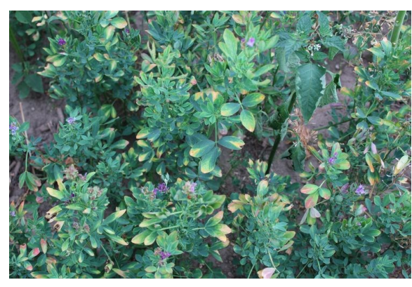
Potato leafhopper hopperburn

There are numerous reports of alfalfa fields with significant levels of hopperburn. Unfortunately, once hopperburn is visible, the damage is done.